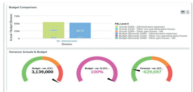
Budget - actuals comparison 1